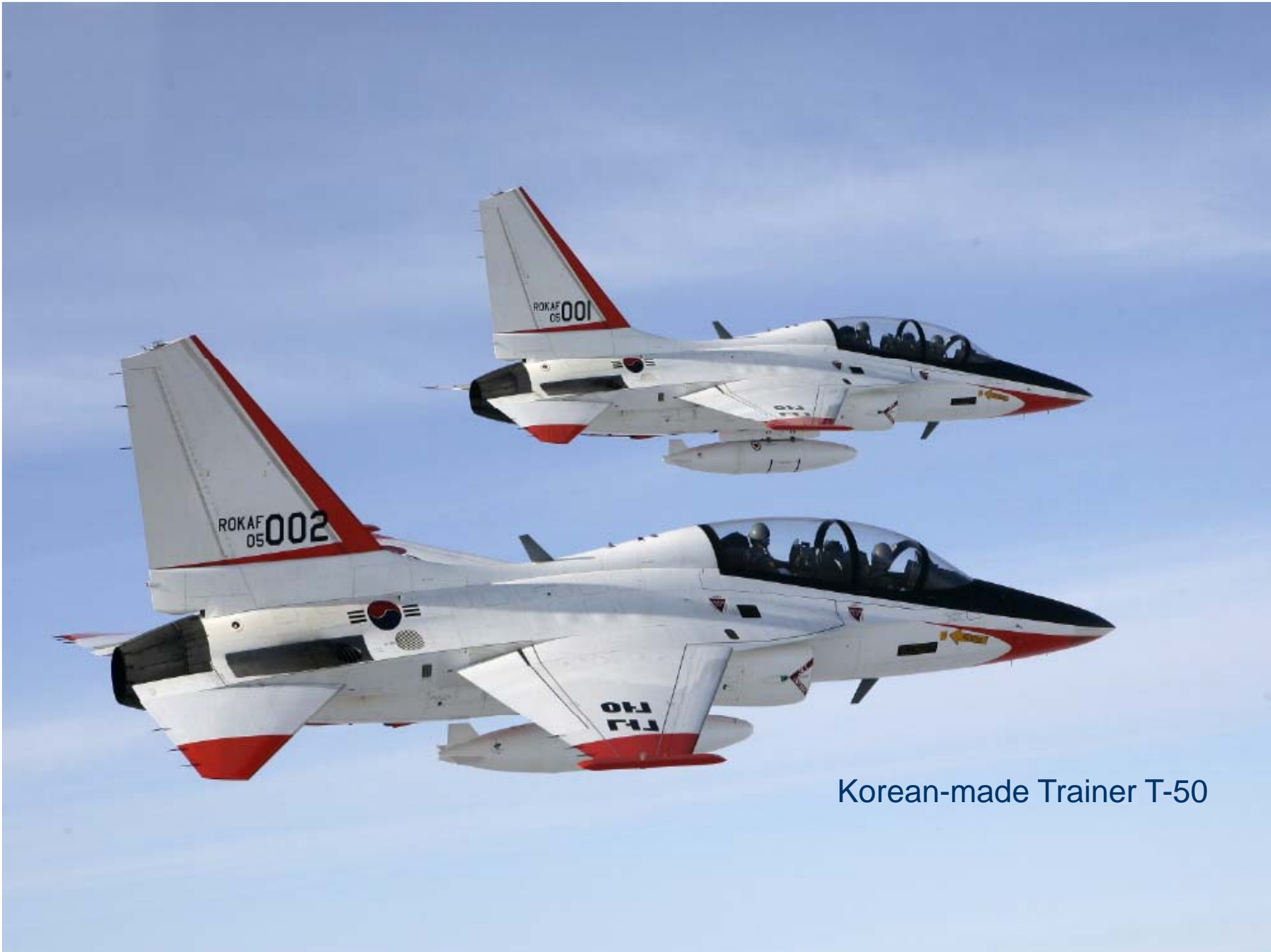
Korean-made Trainer T-50