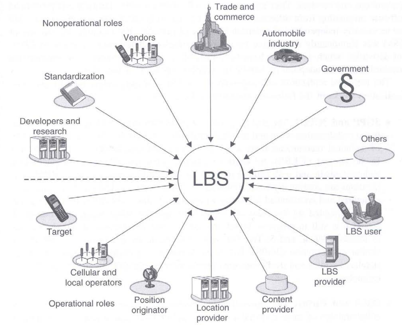
Figure 1.2 Roles for LBSs.