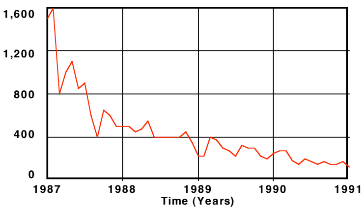
Semiconductor Fabrication Defects (ppm)

The figure below shows data on defects from the wafer fabrication process of a mid-size semiconductor firm (from Figure 4-5 in Business Dynamics ). The firm began its TQM program in 1987, when defects were running at a rate of roughly 1500 parts per million (ppm). After the implementation of TQM, the defect rate fell dramatically, until by 1991 defects seem to reach a new equilibrium close to 150 ppm—a spectacular factor-of-ten improvement. Note that the decline is rapid at first, then slows as the number of defects falls.