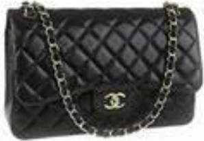
Chanel Jumbo Classic Flap Price History BY YOOGISCLOSET.COM